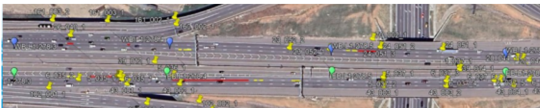
Distress/Rut/IRI on Google Earth